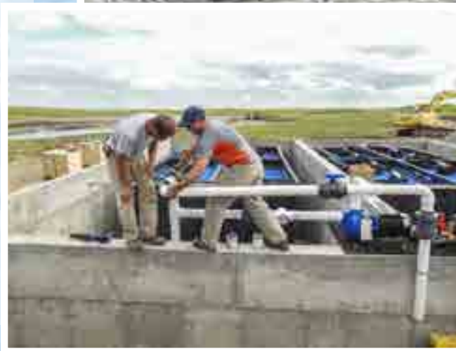
MyFAST ® 8.0