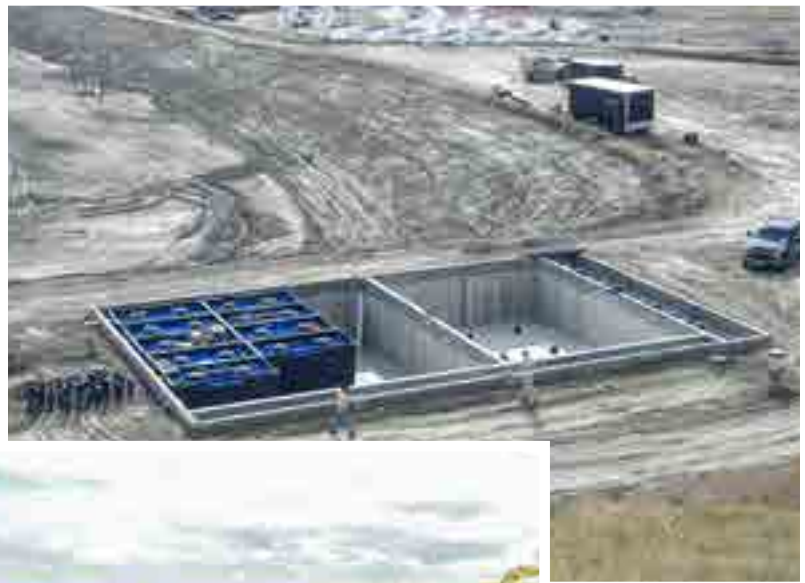
MyFAST ® 12.0

Ideal for small communities or larger commercial properties, this system maintains consistently high performance with minimal maintenance.