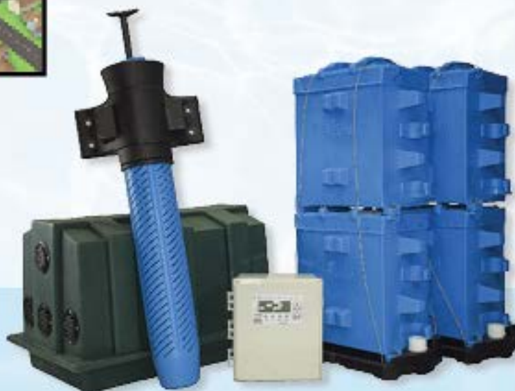
Pictured: HSMBR® membrane modules, control panel, blower housing, SaniTEE®