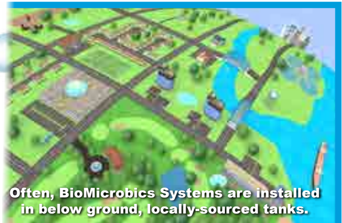
Often, BioMicrobics Systems are installed in below ground, locally-sourced tanks.